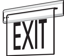
"WATERFALL" WALL MT