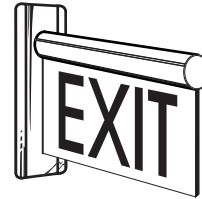
END MT STANDARD