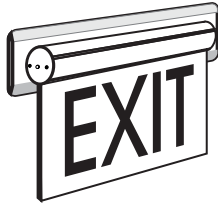
STANDARD WALL MT