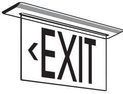
TOP MT RECESSED