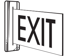
END MT FREE LENS